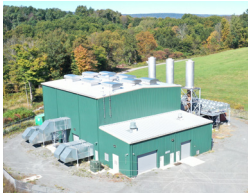
Alpac Energy LLC Cantan Township Bradford County, PA COD: April 2017