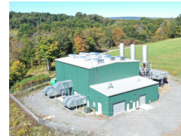
Wolf Run Energy LLC Wilmont Township Bradford County, PA COD: June 2019