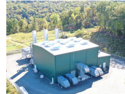
Milan Energy LLC Smithfield Township Bradford County, PA COD: March 2017