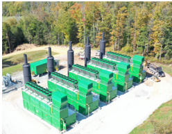
Oxbow Creek Energy LLC Nicholson Township Wyoming County, PA COD: December 2019