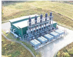
Roundtop Energy LLC Auburn Township Susquehanna County, PA COD: October 2015