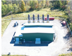
Beaver Dam Energy LLC Canton Township Bradford County, PA COD: March 2016